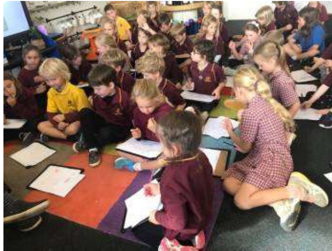
Year 1's busy practicing illustrator techniques