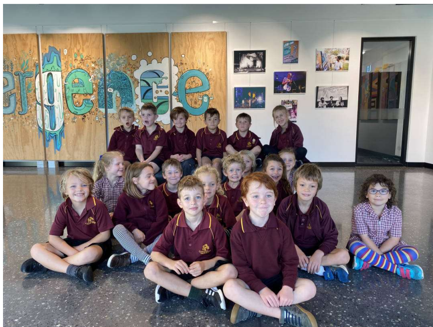
Room 1 at the MR Heart Foyer