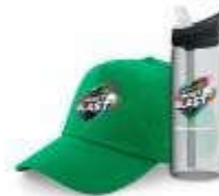
MASTER BLASTERS KIT