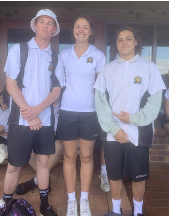
Ex Cowaramup students from MRSHS helping out at the Tennis Gala